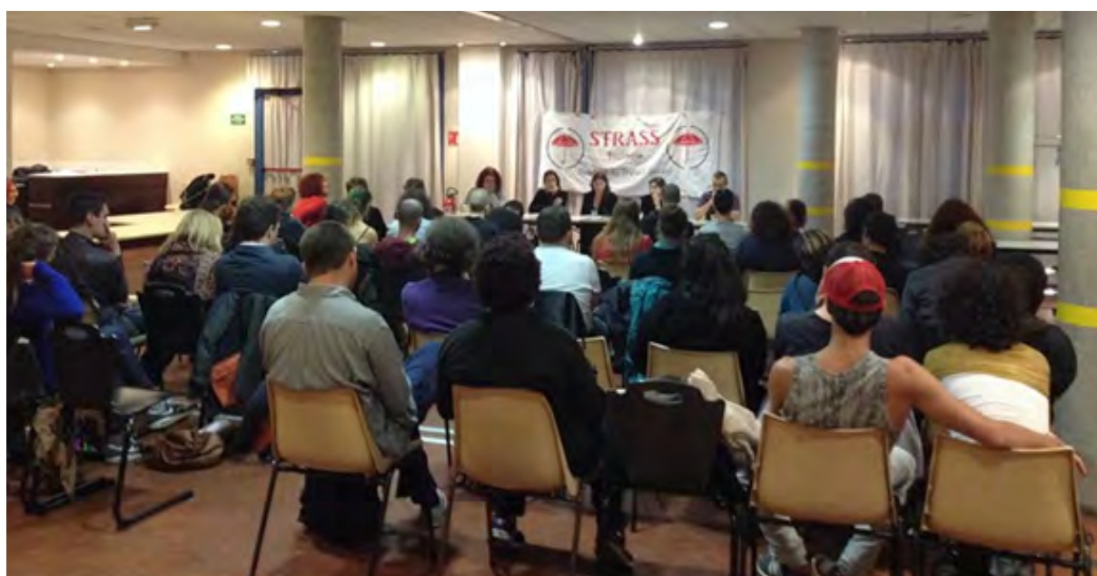
ICRSE/STASS Training in Toulouse, France, 1–3 October 2015.

The last national community training course on “Sex Work, HIV and Human Rights” took place in Toulouse, France, on 1–3 October 2015, thanks to the collective efforts of the French sex workers’ union STRASS and ICRSE. The training brought together around 15 sex workers of all genders, from different cities across the country, and gave them a chance to discuss matters including opportunities and barriers to sex workers’ engagement in the design and implementation of community-led HIV prevention programming. The three-day programme ended with a public meeting attended by around 100 people, including sex workers, representatives of different political parties, trade unions and civil society organisations. During the meeting, programme participants raised awareness about sex workers’ rights and health needs, advocated for the decriminalisation of sex work, and presented the different strategies undertaken by STRASS to support community mobilisation and strengthening in France.