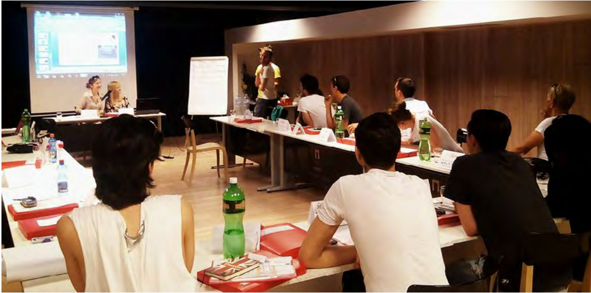
ICRSE/STAR-STAR Training in Skopje, Macedonia, 31 May and 2 June 2015.