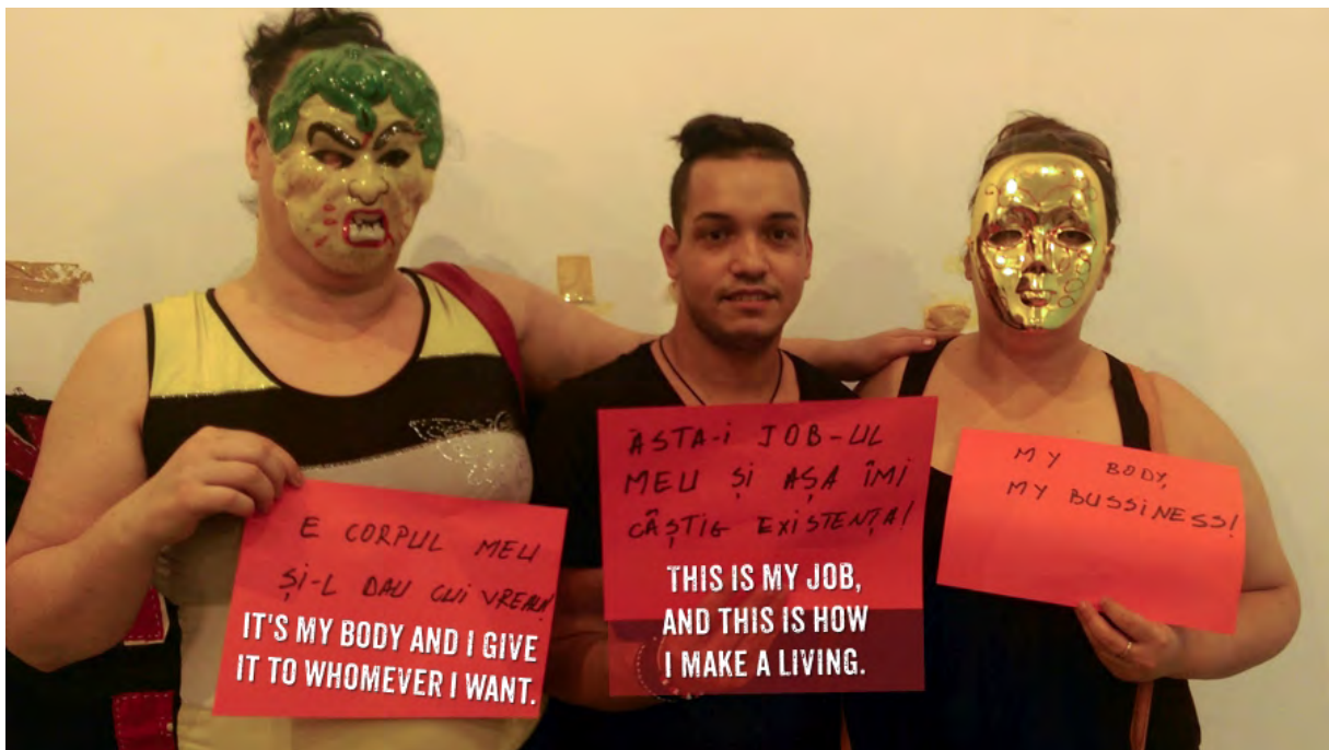
ICRSE/Carusel Training in Bucharest, Romania, 31 August and 4 September 2015.

The third training course on “Sex Work, HIV and Human Rights” was held in Bucharest, Romania, by ICRSE and Carusel, a non-governmental organisation providing HIV prevention programming for sex workers in Romania. Since the efforts to develop a sex worker-led organisation have so far not been fully successful, this programme was one of the very first opportunities for sex workers in the country to come together and discuss issues directly affecting their life, safety and health. Thus, between 31 August and 4 September 2015, over 20 sex workers of all genders had the chance to learn about their rights, also with respect to HIV, the legal framework governing sex work in Romania, and the history of sex workers’ engagement in the response to HIV across Europe and globally. The workshop triggered great energy and passion in the sex worker community in Romania and encouraged sex workers to write a letter to the Ministry of Health listing their demands and expectations.