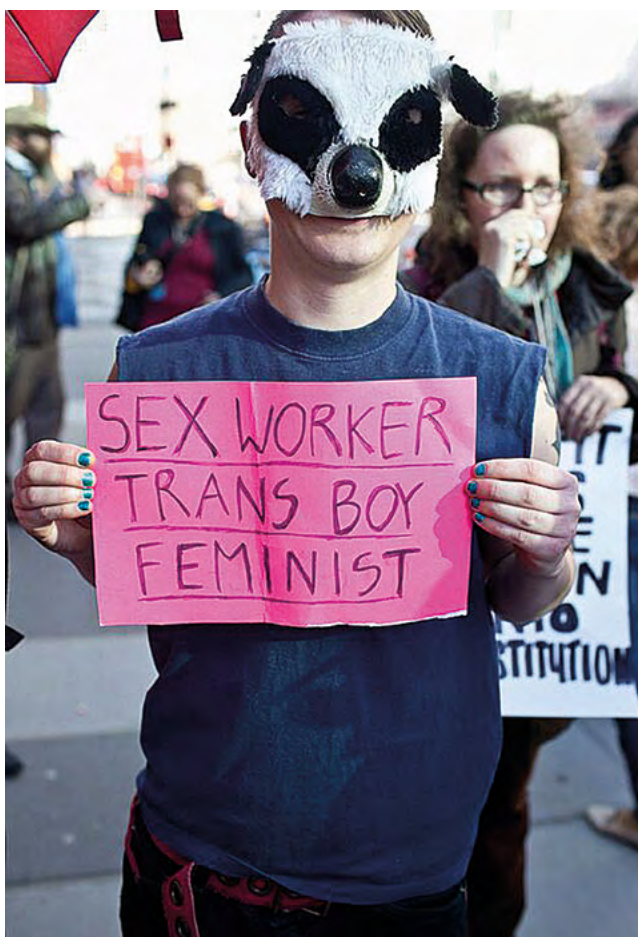
Member of Sex Worker Open University protests at the Stop Porn Culture Conference, London, UK, 2014.