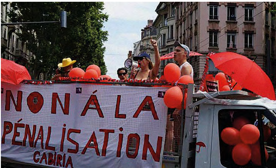
Members of STRASS at LGBT Pride Lyon, France, 2013.

http://www.dialogai.org/actualites/2014/06/droit-des-trans-pma-ivg-gpa-prostitution-nos-corps-nos-choix-le-mot-dordre-lyonnais-de-la-marche-des-fiertes-fait-des-vagues/