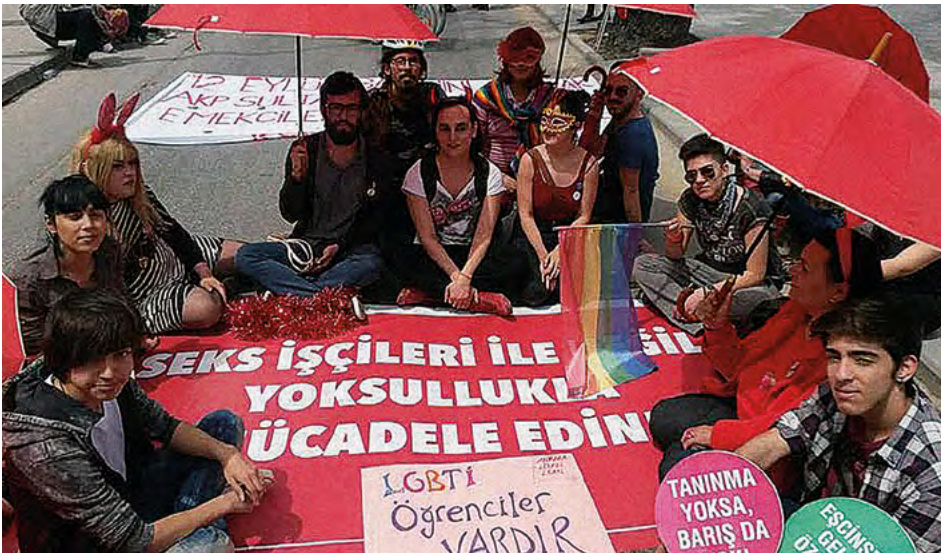
Members of Kirmizi Semskiye (Red Umbrella Sexual Health and Human Rights Association), at May Day protest, Ankara, Turkey. The signs say: “Don’t fight against sex workers. Fight against poverty”. “LGBTI students exist”; “No recognition (of rights), no peace”