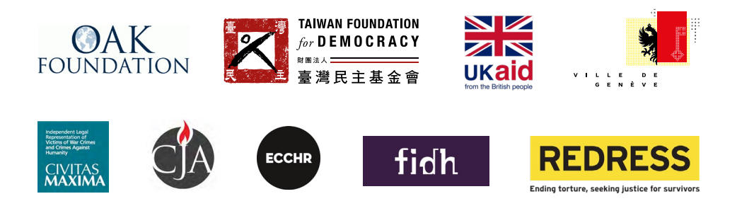
This publication benefited from the generous support of the City of Geneva, UKAID from the UK Government, the Oak Foundation and the Taiwan Foundation for Democracy. It was researched with the contribution of Civitas Maxima, the Center for Justice and Accountability, the European Center for Constitutional and Human Rights, the International Federation for Human Rights and REDRESS.

Universal jurisdiction, an overlooked tool to fight conflict-related sexual violence #UJAR