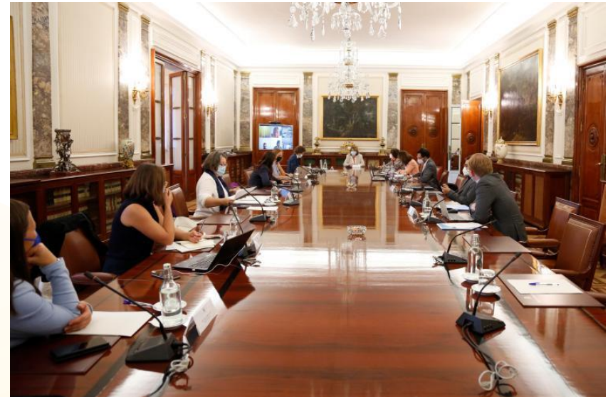
Meeting of the Criminal Justice SWG in Madrid last September-Office of the Prosecutor General of Spain

Centro de Estudos Judiciários (Portugal)