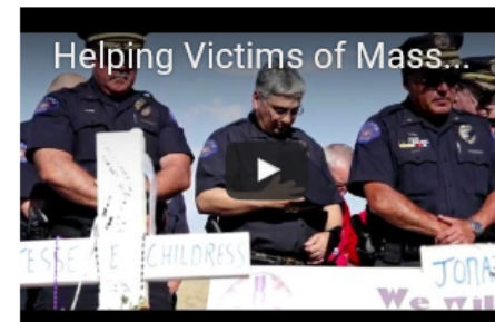
Helping Victims of Mass...