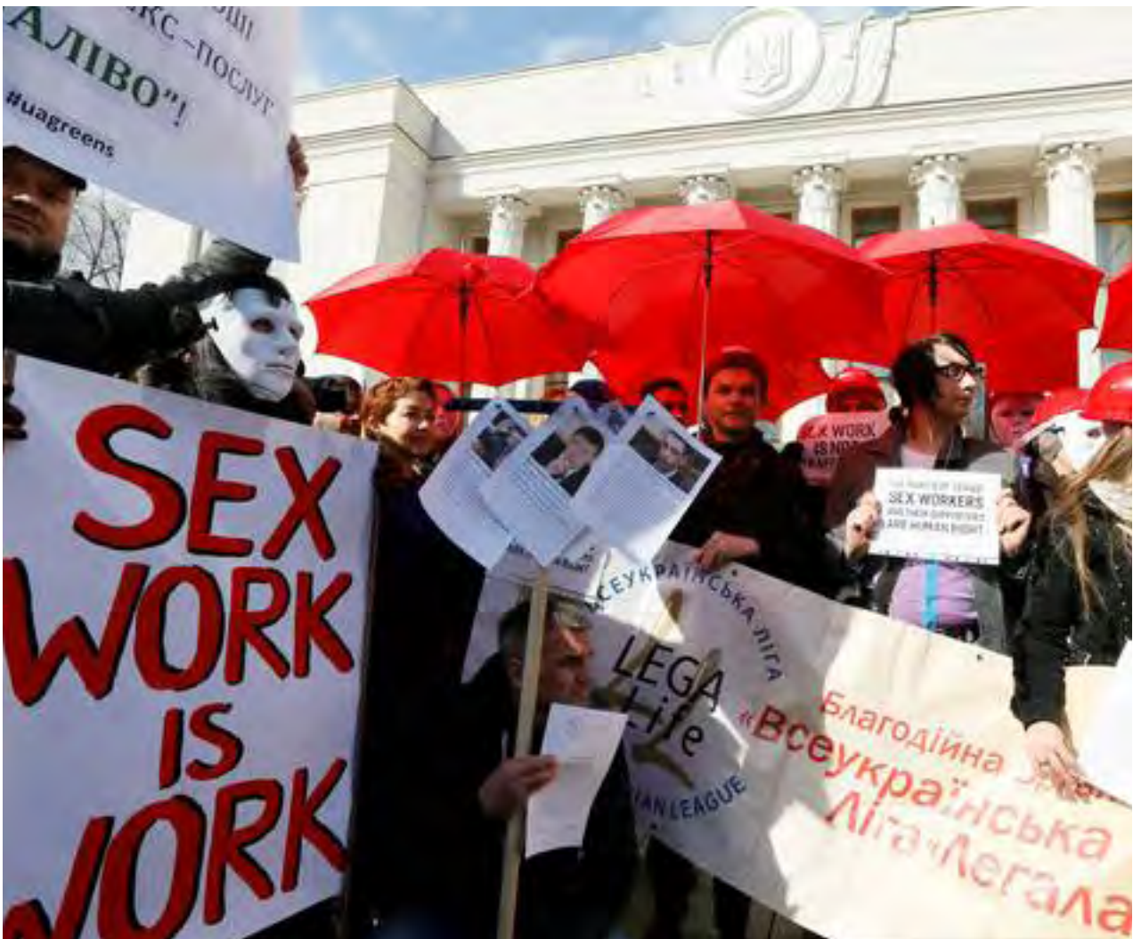
Sex workers wearing masks hold placards reading 'Sex work is work', 'Legalisation but not criminalisation', 'My work is my choice' at a protest in front of the Ukrainian parliament in Kiev, Ukraine on the 3rd of March 2017.

Sex work is a typical informal economy job in that it does not benefit from legal protection through the state. It mainly employs women, often (undocumented) migrants; entry requirements are low in terms of capital and professional qualifications; and skills needed for the job are often acquired outside of formal education. Many sex workers enter the sex industry as they are excluded from the formal economy or state benefits to achieve a decent standard of living. Similarly to other sectors of the informal economy, most sex work is precarious employment, characterised by insecurity and exploitative conditions, and can include illegalised, seasonal, and temporary employment as well as home work, temp-work, sub-contracting and self-employment.