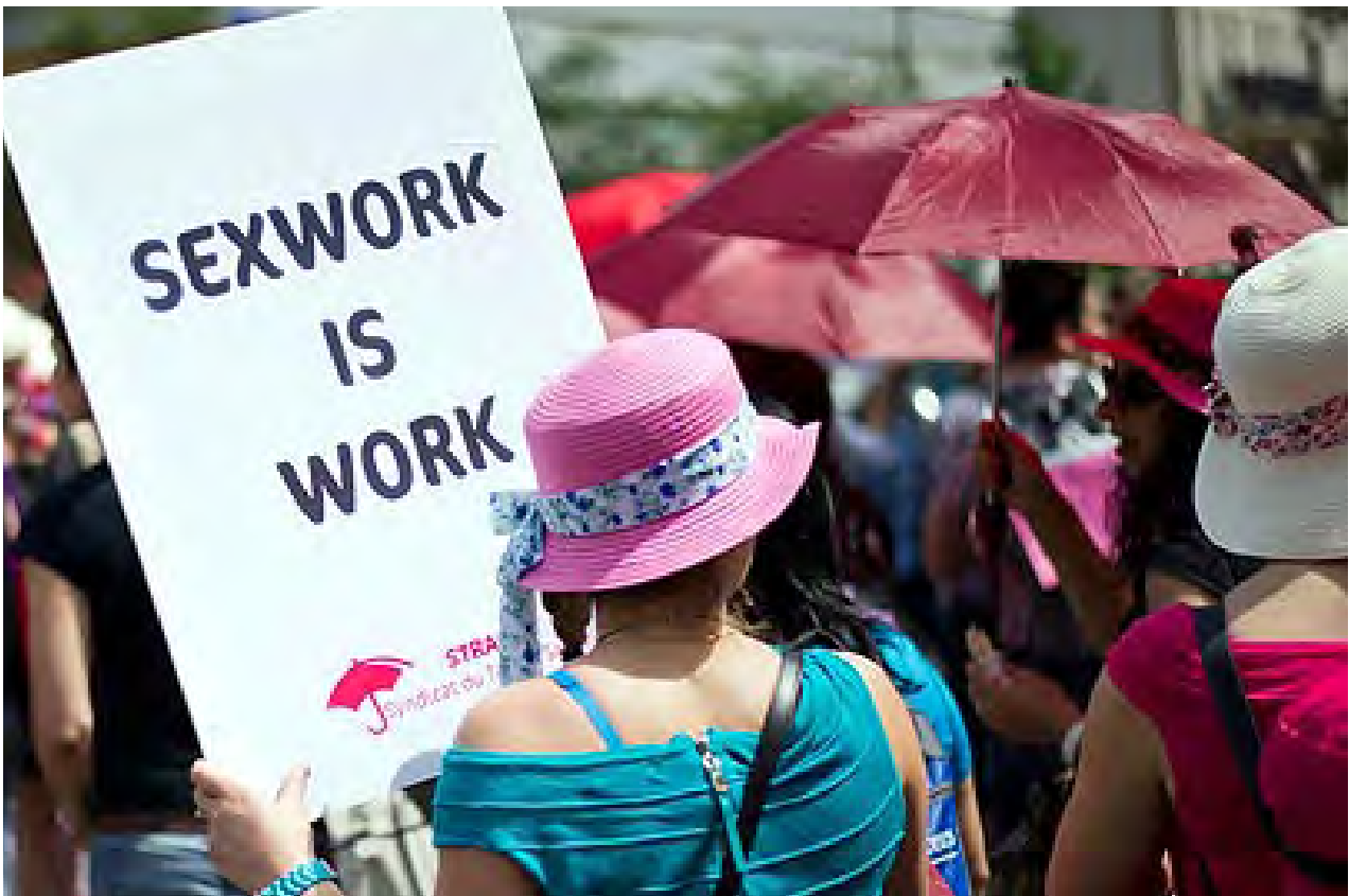
Protester at a sex worker march organised by STRASS, the French Union of Sex Workers.

Since the sex industry was decriminalised in New Zealand, sex workers have gained access to employment protections and have become empowered to take their managers to the Disputes Tribunal if they engage in exploitative practices. Sex workers also have wider protections from discrimination and harassment. For example, in 2014, a sex worker won a case of sexual harassment taken against the manager of a brothel in Wellington. The Human Rights Tribunal awarded her NZ$25,000 compensation for “humiliation, loss of dignity and injury to feelings”. 5