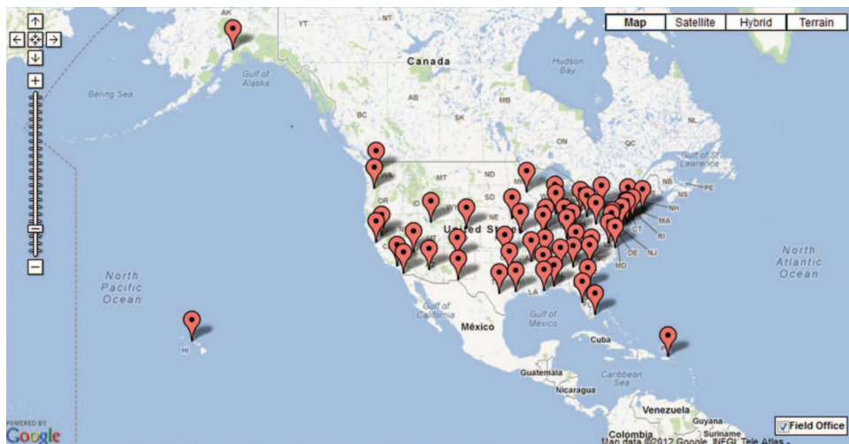
Figure 3. Local FBI offices.

collaborates in the investigation, prosecution, and provision of services to human trafficked victims. It also has its own victim specialists who work alongside the victim specialists from the U.S. Attorney offices. For example, in Nebraska, the FBI Unit in Omaha works with the U.S. Attorney office that covers Omaha, NE, and Council Bluffs, IA, areas, with both offices' victim specialists working hand-in-hand on cases and training.