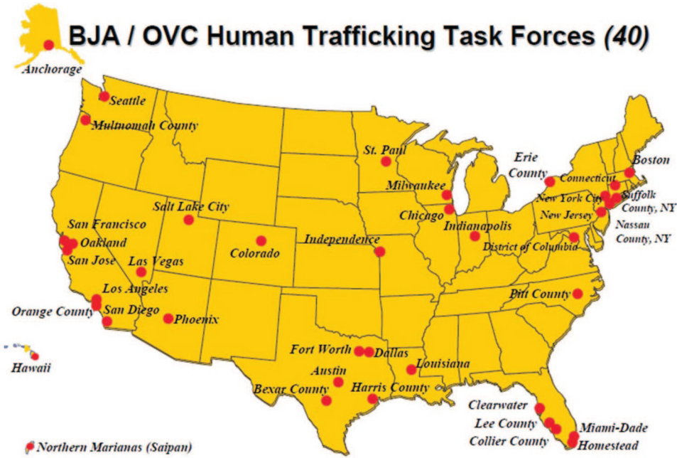
Figure 1. BJA/OVC Human Trafficking Task Forces (40).