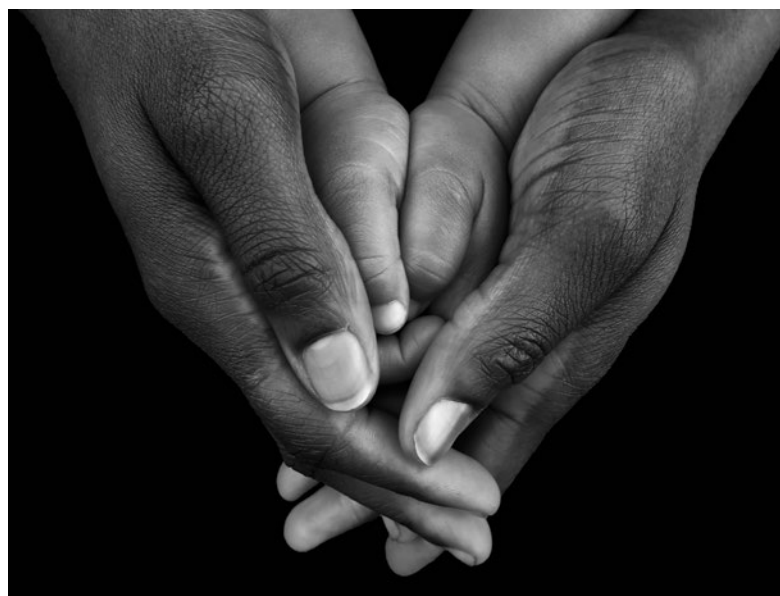
This little light of mine – October 2015 – UK

An article or report which gives a positive image of a survivor and also acknowledging the extent of her suffering arouses empathy from the public, raises awareness and helps to empower survivors and communities to speak out against FGM. Story-telling is powerful and crucial in humanising survivors, and data , e.g. from the WHO 24 or UNICEF 25 research, legal situation and expert advice give context to the human rights violation and emphasise the need for further action.