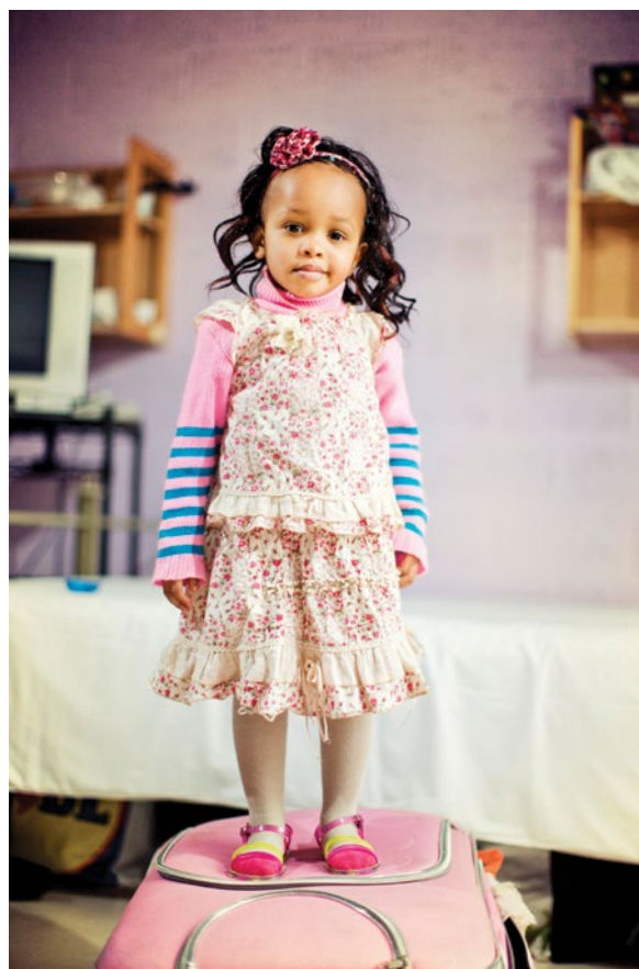
Niet met mej (Not with me) © Jonas Lampens – February 2014 - Belgium