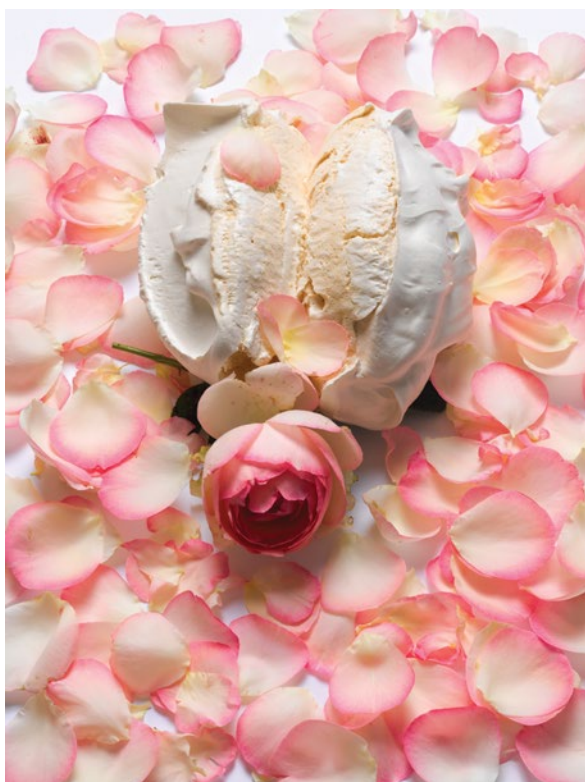
The Meringue Project, Endless Beauty

in an operating theatre can be at least as harmful as FGM performed as part of a traditional ritual. It can cause death 18 , does not prevent pain or other physical short-term and long-term consequences, and can even cause further internal physical damage to the genital organs 19/20 . It also causes psychological trauma for survivors. Finally, it is illegal for healthcare practitioners to perform this procedure, as it notably contravenes the medical principle of “do no harm”.