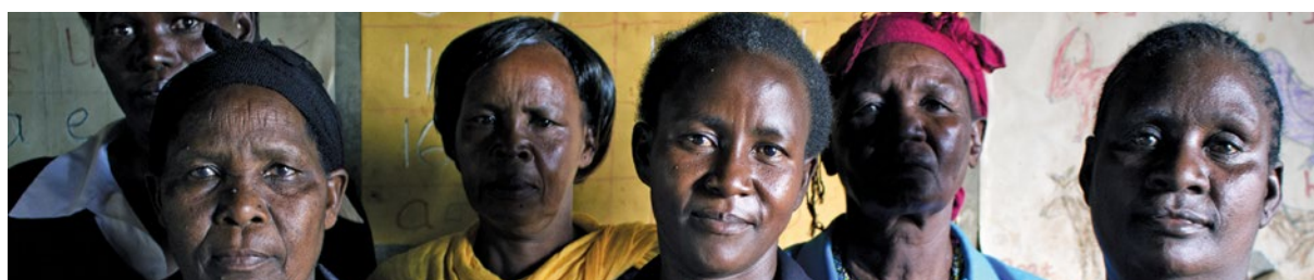
Teachers / – December 2016

or his life. We use this term to emphasise the woman or girl's resilience and as an empowering element of language , but without prejudice to the fact that the woman or girl may prefer to use the term victim .