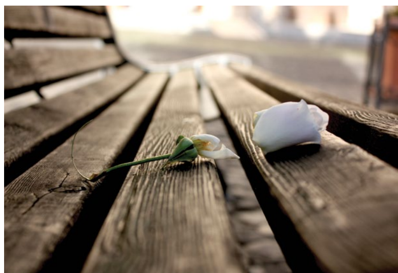
La Belleza sottratta (Stolen beauty) © Giuseppe Matese – September 2015 - Italy

In the early years of the movement against FGM, one of the arguments against the practice was that it is not “safe”. Indeed, FGM is not safe . It has adverse physical and psychological consequences on women and girls’ health and wellbeing, only part of which are caused by the potential lack of medical knowledge of the practitioner, the possibly unhygienic conditions and use of unsterilized instruments. Amongst pro-FGM movements and communities, this argumentation has triggered a counter-narrative and practice which focused on the sanitary conditions in which FGM is practised: in their discourse, medicalising FGM makes the practice “safe”. This is inaccurate. FGM performed