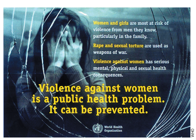
Figure 3: WHO poster highlighting mental effects of abuse

Finally, alcohol and drug abuse is the other mentalhealth problem most frequently seen in battered women in industrialised countries.<sup>2,8,20,55,56</sup> In at least two comparisons between abused and non-abused women,