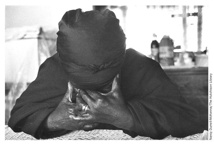
Figure 1: Domestic violence is more prevalent than most health-care providers realise

The injuries, fear, and stress associated with intimate partner violence can result in chronic health problems such as chronic pain (eg, headaches, back pain) or recurring central nervous system symptoms including fainting and seizures. <sup>2,6,8,21-25</sup> The exact mechanism of such effects has not been established but could include recurrent injury or stress, alterations in neurophysiology, or both. For instance, abused women frequently (10–44%) report choking—incomplete strangulation—and blows to the head resulting in loss of consciousness, <sup>8,26</sup> both of which can lead to serious medical problems including neurological sequelae.